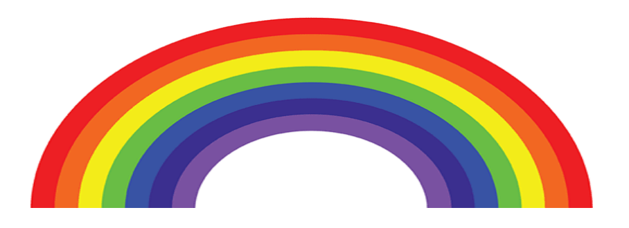
3. Coming to Nursery